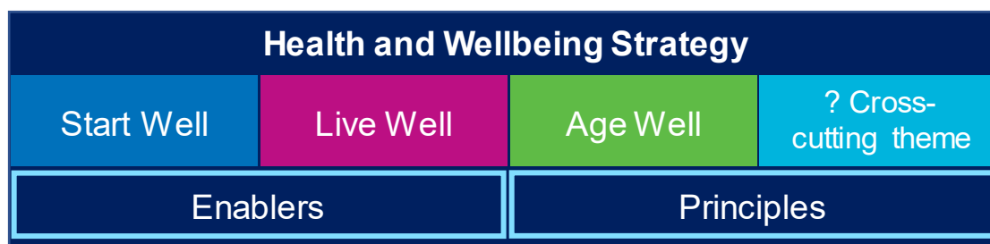
Figure 4. Proposed high level structure of Health and Wellbeing Strategy

representation of this framework is provided below. The Health and Wellbeing Board is requested to approve the overarching framework for the strategy.