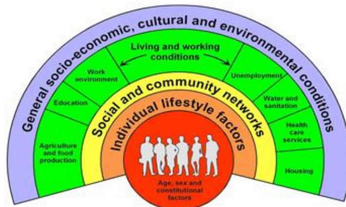
Figure 2: Dahlgren and Whitehead rainbow to illustrate wider determinants of health and scope of the health and wellbeing strategy