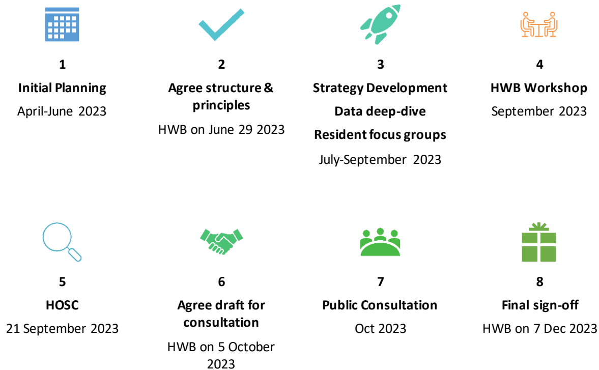
Figure 3: Timeline for updating the Health and Wellbeing Strategy